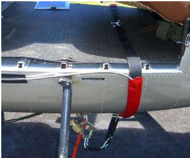
SIDE VIEW OF BELLY BAND SECONDARY RELEASE

The bottom of the 3-ring release is attached to the top ring of the rope using two steel carabiners. The top ring of the rope is then attached to the cargo hook.