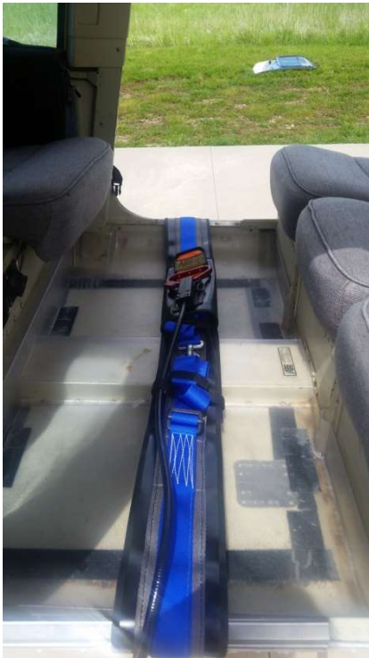
VIEW OF BELLY BAND ACROSS THE REAR FLOOR OF 206L4 CABIN