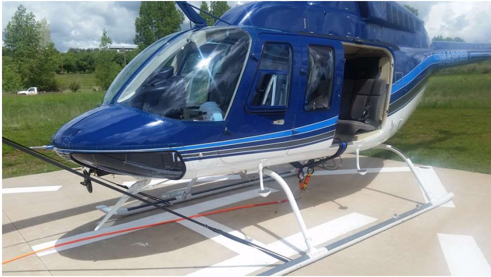
EXTERNAL VIEW OF SHORT-HAUL ANCHOR RELEASE SYSTEM

The Bell 206 L4 uses the belly band style secondary release system.