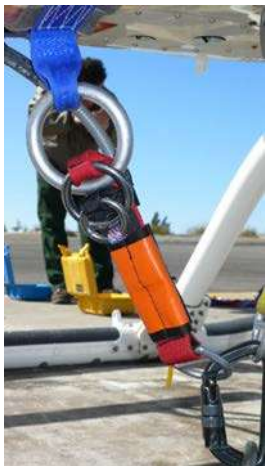
FRONT VIEW OF 3-RING SECONDARY RELEASE