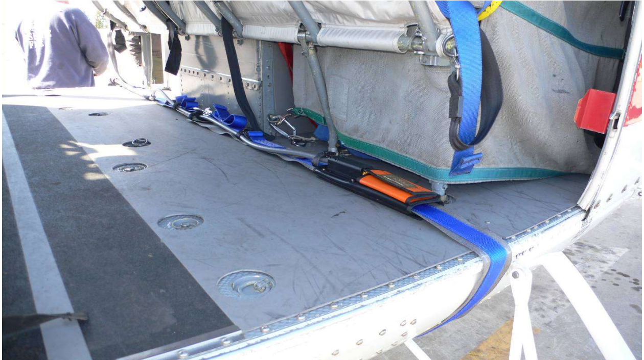
VIEW OF SECONDARY RELEASE BELLY BAND AND SPOTTER STATION

The Bell 205 A++ uses a belly band style secondary release system.