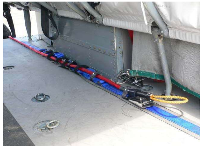
VIEW OF RELEASE HANDLE UNSHEATHED