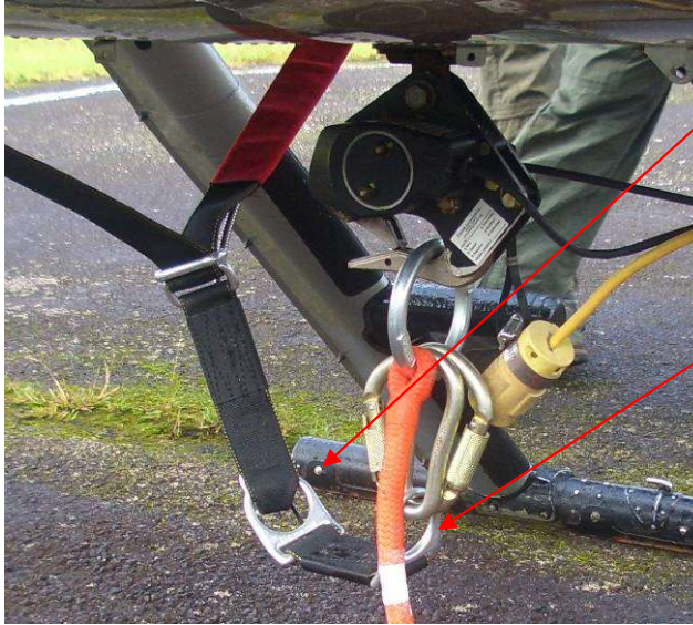
VIEW OF THE PRIMARY AND SECONDARY RELEASE

The MD 500 uses the belly band style secondary release system.