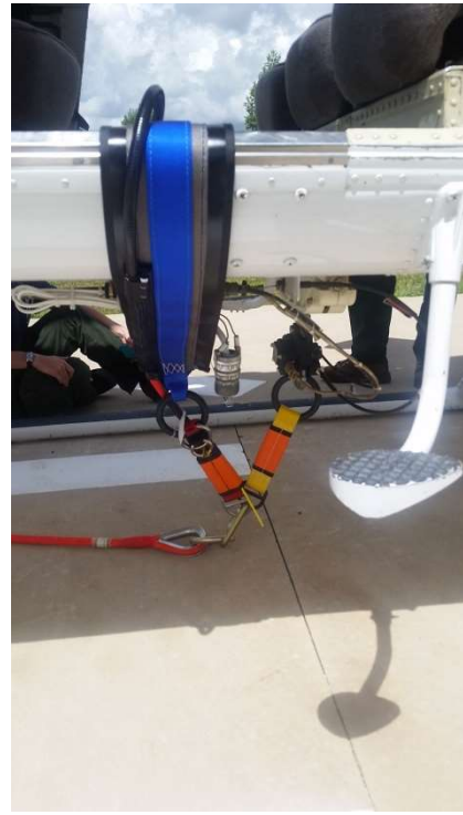
VIEW OF THE PRIMARY AND SECONDARY RELEASE