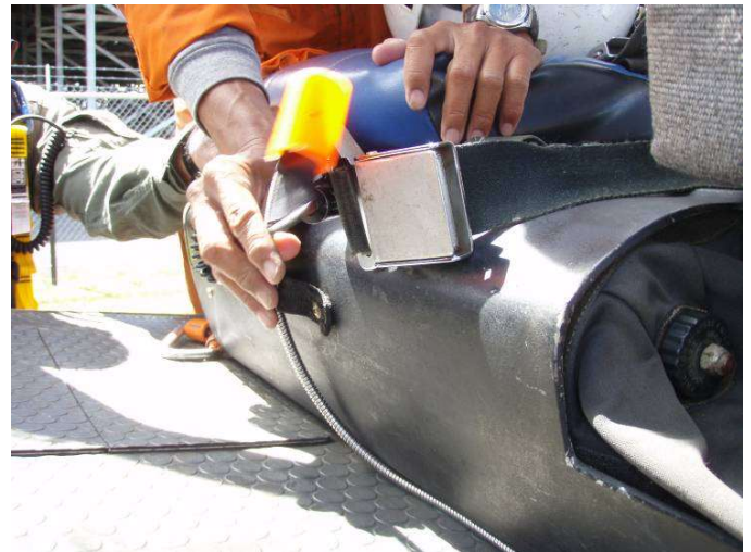
VIEW OF SECONDARY RELEASE HANDLE MOUNTED BETWEEN TWO FRONT SEATS. ACCESSIBLE BY BOTH PILOT AND SPOTTER.